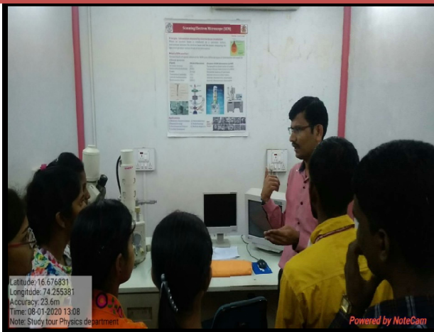
Visit to Physics instrumentation facility center (PIFIC) at Shivaji University, Kolhapur