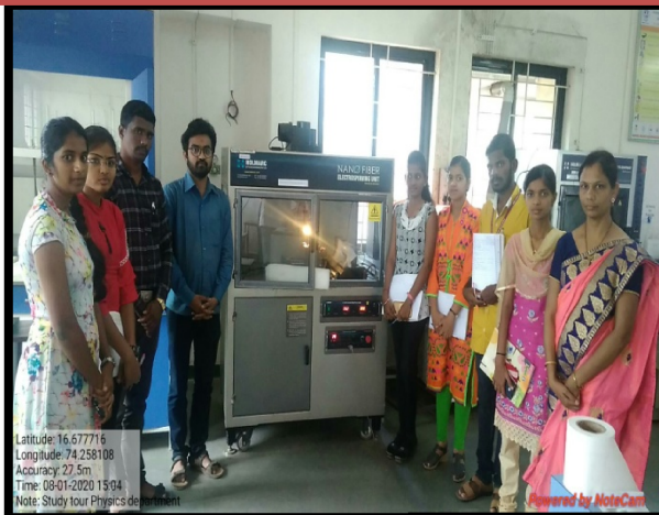
During study tour, Visit to School of Nano science & Nanotechnology, Shivaji University, Kolhapur

Total 10 participants from physics Department